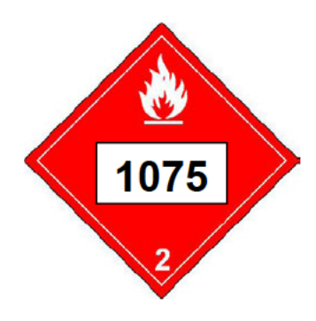
Figure 2: TDG Placard for Liquefied Petroleum Gas (LPG)

Propane is stored in its liquid form and can expand 270 times its size when converted to the gas phase. The proper shipping name of propane is Liquefied Petroleum Gas ("LPG") and the Transportation of Dangerous Goods ("TDG") placard for LPG in large means of containment is illustrated below in Figure 2. The placard shows that LPG is a Class 2 flammable gas with a UN (United Nations) Number of 1075.